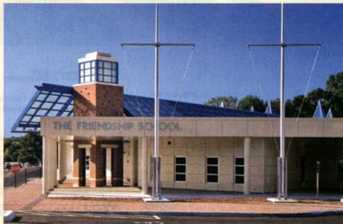
EXTERIOR VIEW ENTRANCE - PARTIAL FRONT ELEVATION