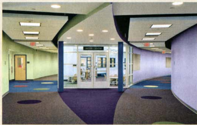
CORRIDOR - VIEW TOWARD MEDIA CENTER

The result of an exceptional 20-year collaboration between two socioeconomically diverse seaside communities, this remarkable school is NAEYC-accredited and serves 520 3- to 5-year-olds in a fully inclusive setting. The Friendship School's planning, architecture, and interior design support brain-based learning; promote children's four basic environmental needs—movement, comfort, competence, and control; and enable educators to teach in the ways that